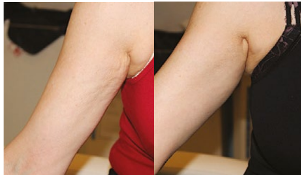
Before and after Profilo