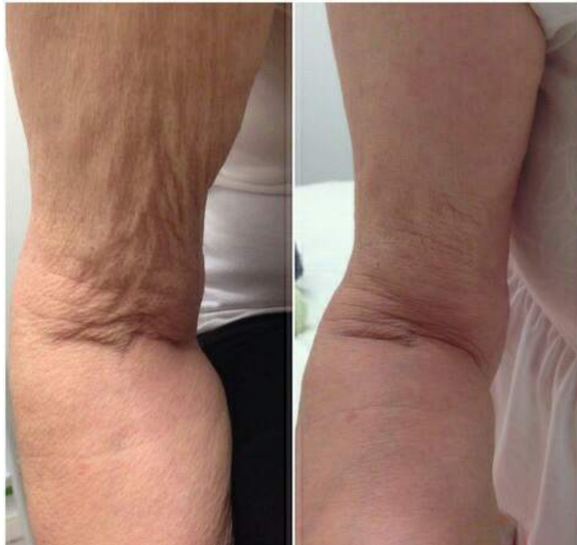
Before (Left) and After (Right) PROFHILO treatment for skin laxity in the arms.