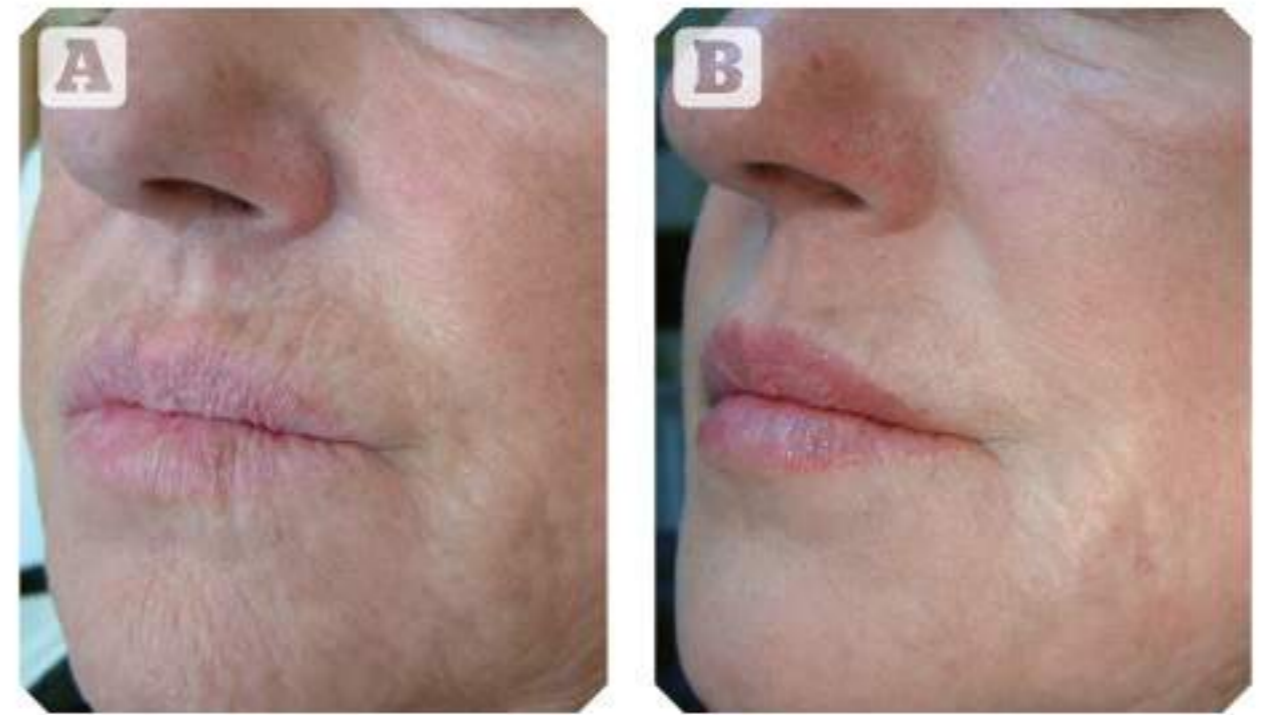
Figure 3 (A) Before treatment, and (B) 1 month after second treatment